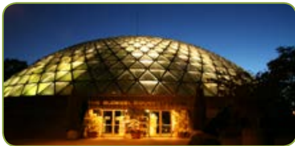
The Bloedel Conservatory