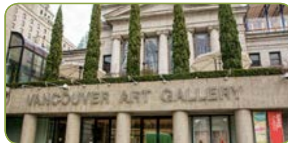
Vancouver Art Galery