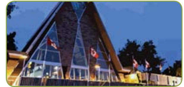
Vancouver Maritime Museum