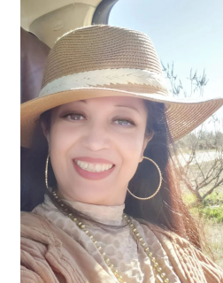
Amb Smily Mukta, USA