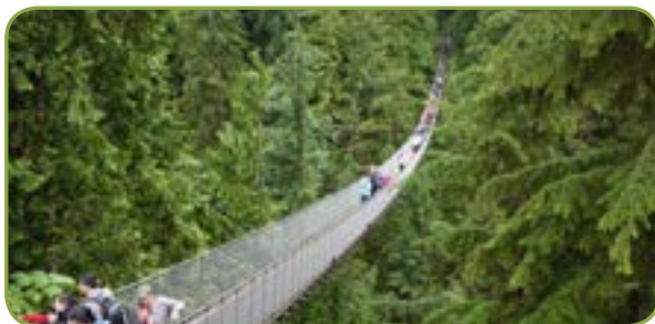
Capilano Suspension Bridge Vancouver