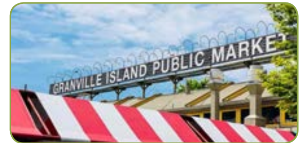
Granville Island Market