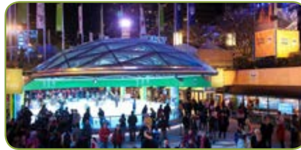
Robson Square Ice Rink