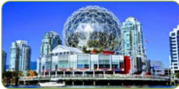
Science World Museum