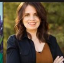
SUSTAMENDOLA International Yoga Tempist United States